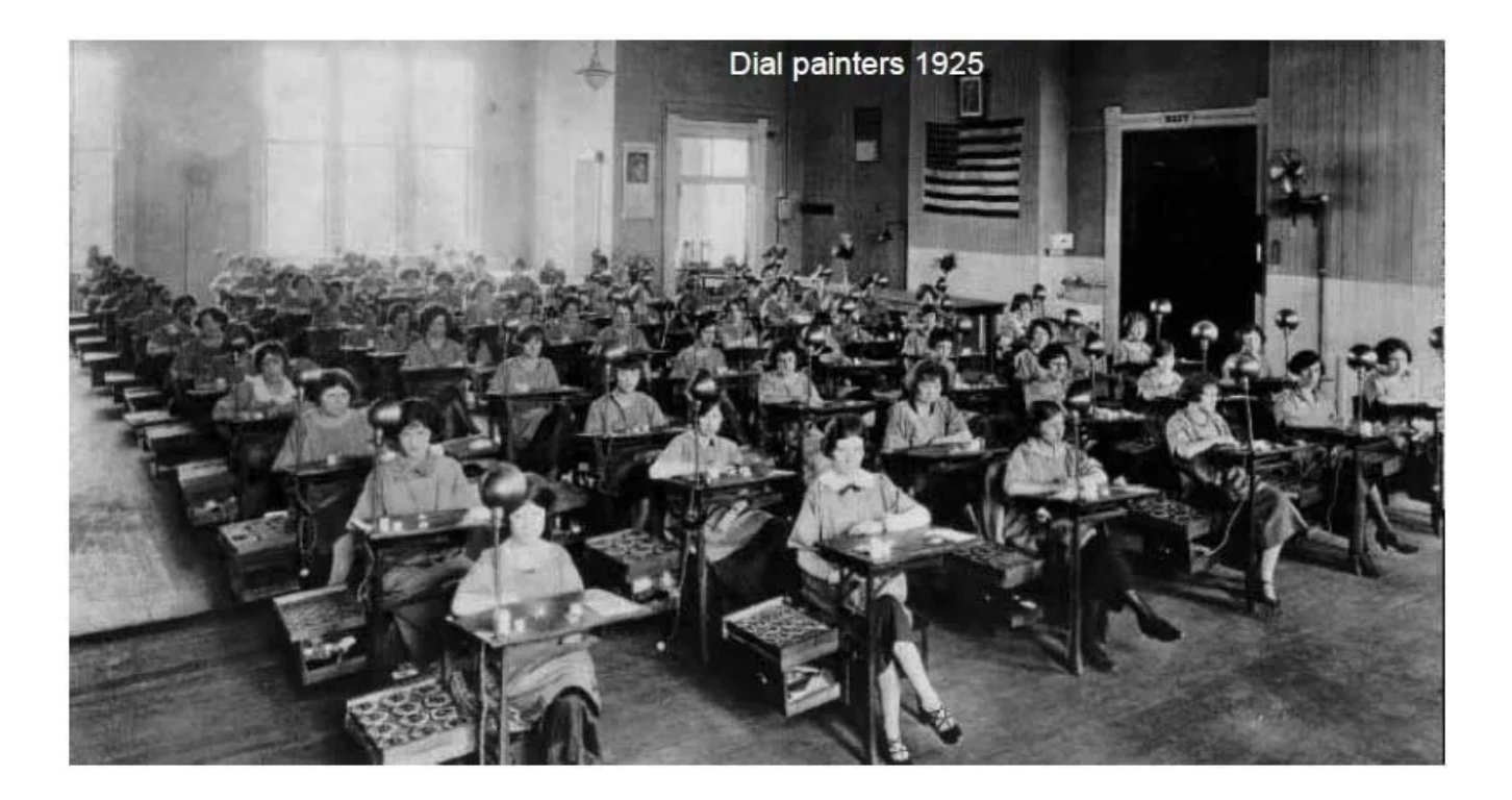
Figure 2. Radium Dial Painters

about right. It's estimated that the reddening dose was 600 mSv. But the first public evidence of radiation harm was the radium dial painters.